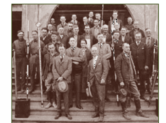
Palos Verdes planning team

From Buffalo to Louisville, Atlanta to Seattle, Baltimore to Los Angeles, the Olmsteds’ work reflects a vision of American communities and American society still relevant today—a commitment to visually compelling and accessible green space that nurtures the body and spirit of all people, regardless of their economic circumstances.