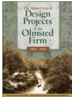
The Master List publication

NAOP’s publication, The Master List of Design Projects of the Olmsted Firm 1857–1979 , is the recipient of the 2009 ASLA Honors Award , calling it “an important volume for all landscape architects and urban planners to track and research Olmsted projects in their cities.”